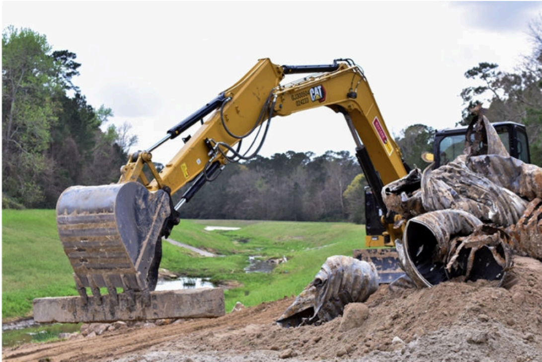
Among other projects at The Woodlands Water Agency, the township's 35 miles of drainage ditches are undergoing $3 million in improvements that will take 12-18 months to complete.

Community Impact recently highlighted the latest updates on water infrastructure planning in The Woodlands. New studies are reshaping project priorities and costs, while keeping long-term system reliability front and center. Read the full article here .