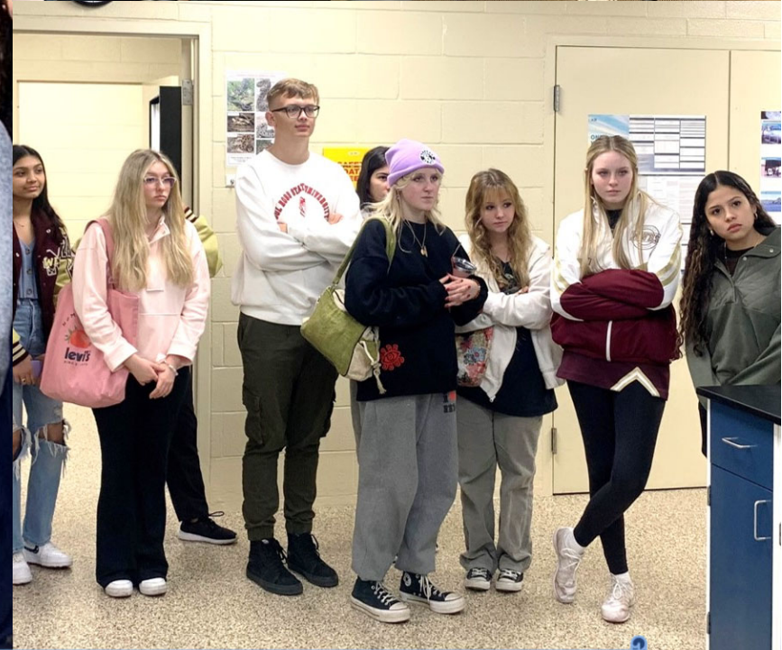
November 18 th – Tour with Magnolia High School