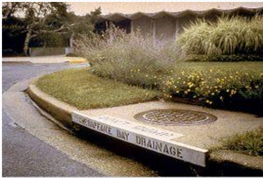
Storm drains can be labeled with stencils to discourage dumping