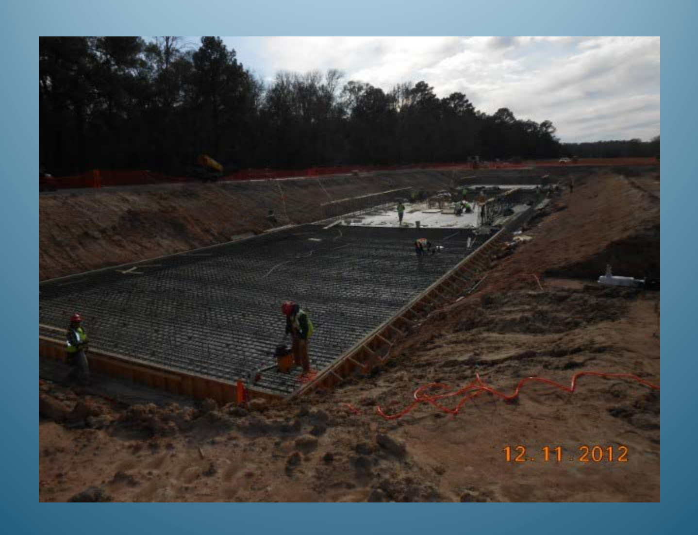
Forming and Placing Reinforcing Steel for HSPS