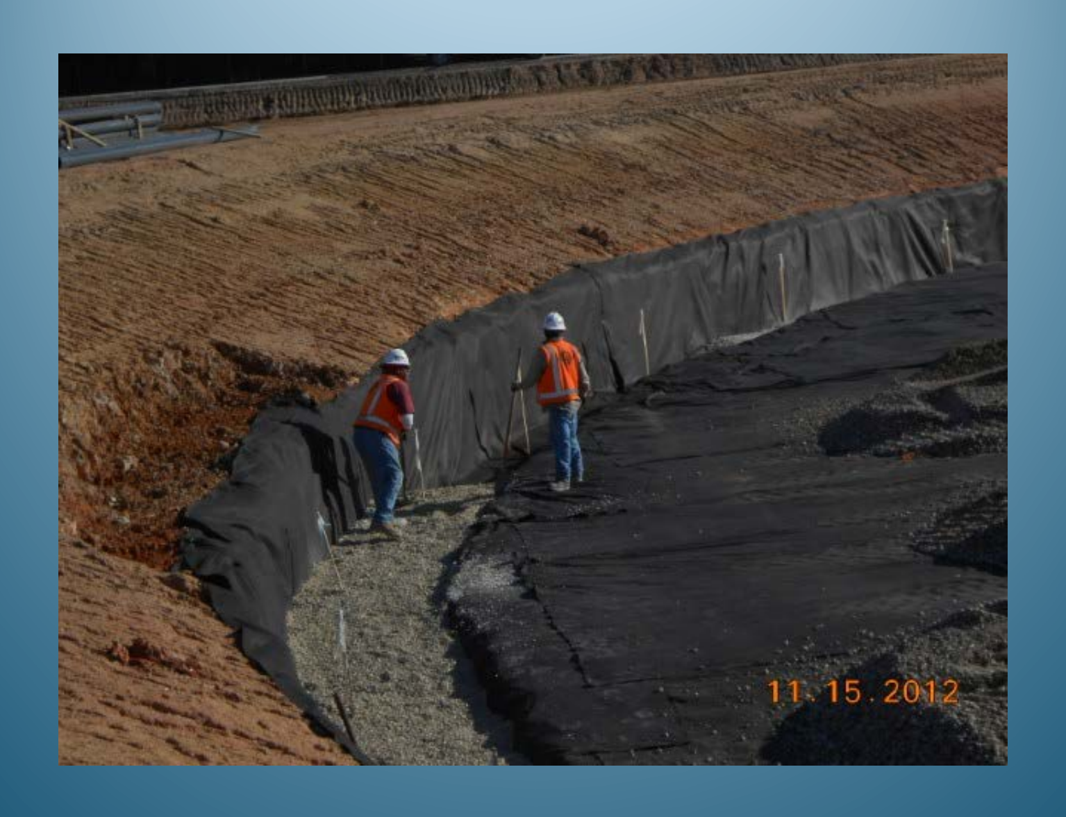
GST Under Drain Rock Installation