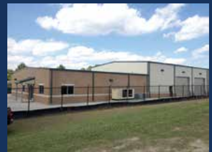
New Highlands EOC

owned by the Authority in Lake Houston and the Trinity River through an extensive 27-mile canal system and 1,400-acre reservoir. It is through this system that raw water is provided to a number of industri-