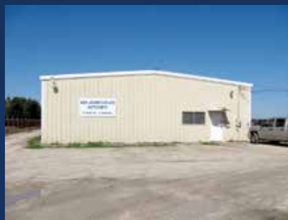
Old Highlands Division operations building.

The EOC is the heart of the Highlands Division operations, which delivers raw water from a large portfolio of water rights