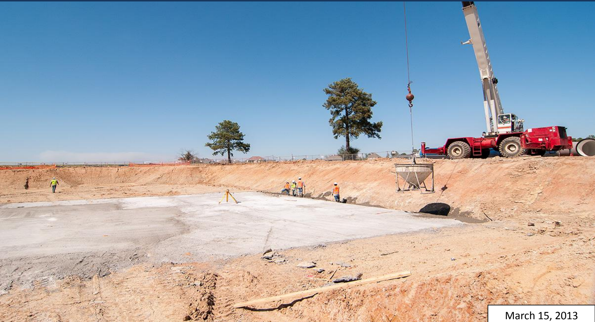
March progress photograph at Pretreatment Facility