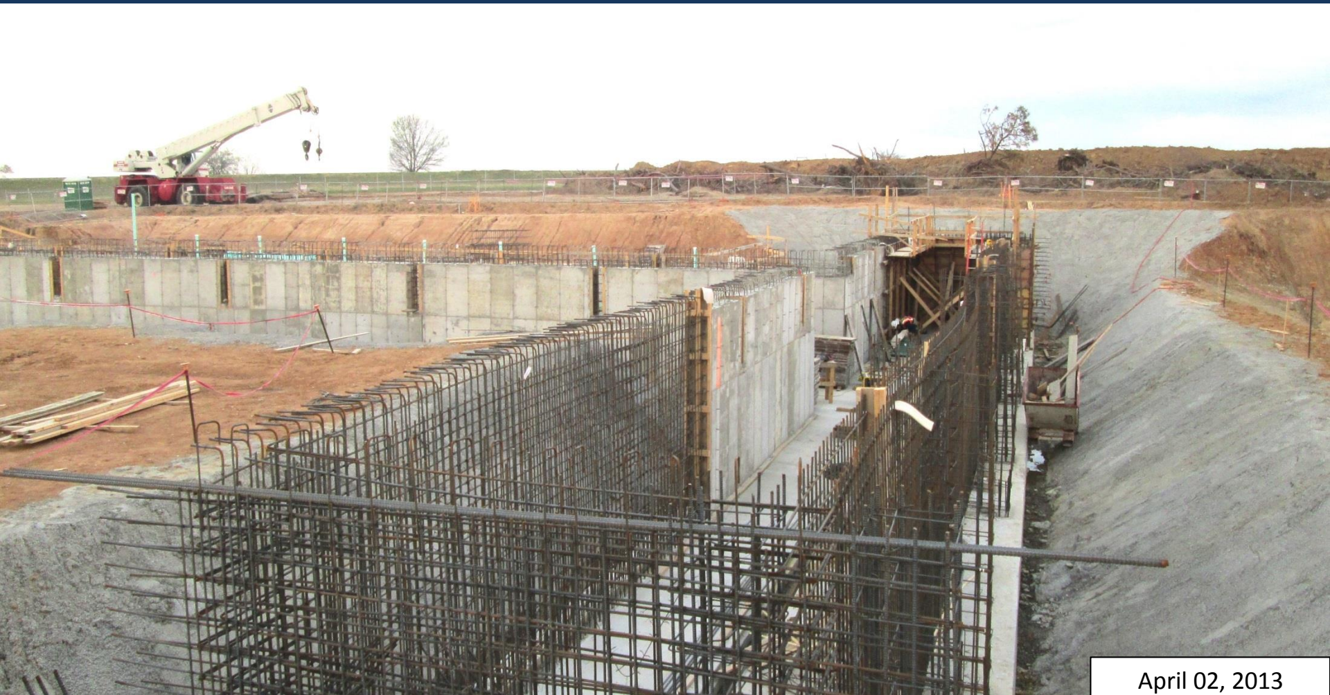
Southeast pipe gallery at the Membrane Building