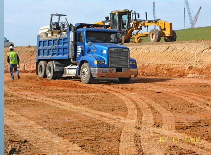
November 13, 2012 – Ground Storage Tank No. 2