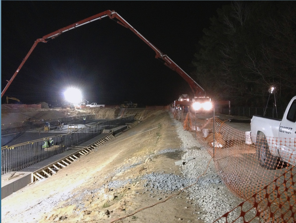
December 14, 2012 - Pouring concrete at 3 AM at discharge bay