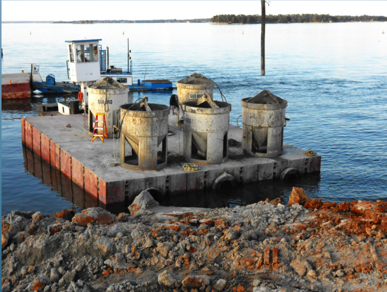
November 20, 2012 - Concrete buckets on barge near RWPS.