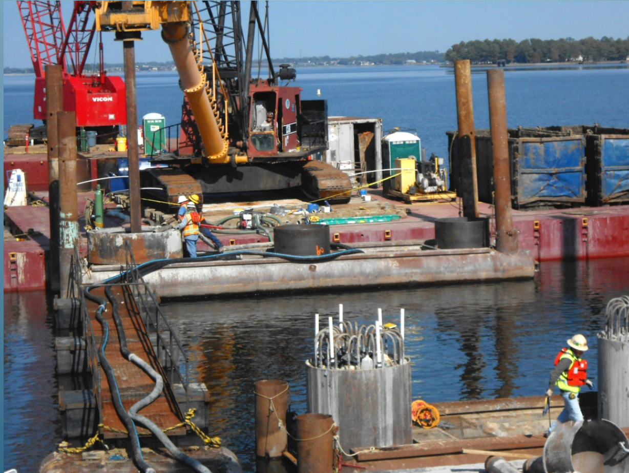
November 5, 2012 - Drilling west pier shaft RWPS Bent No. 3