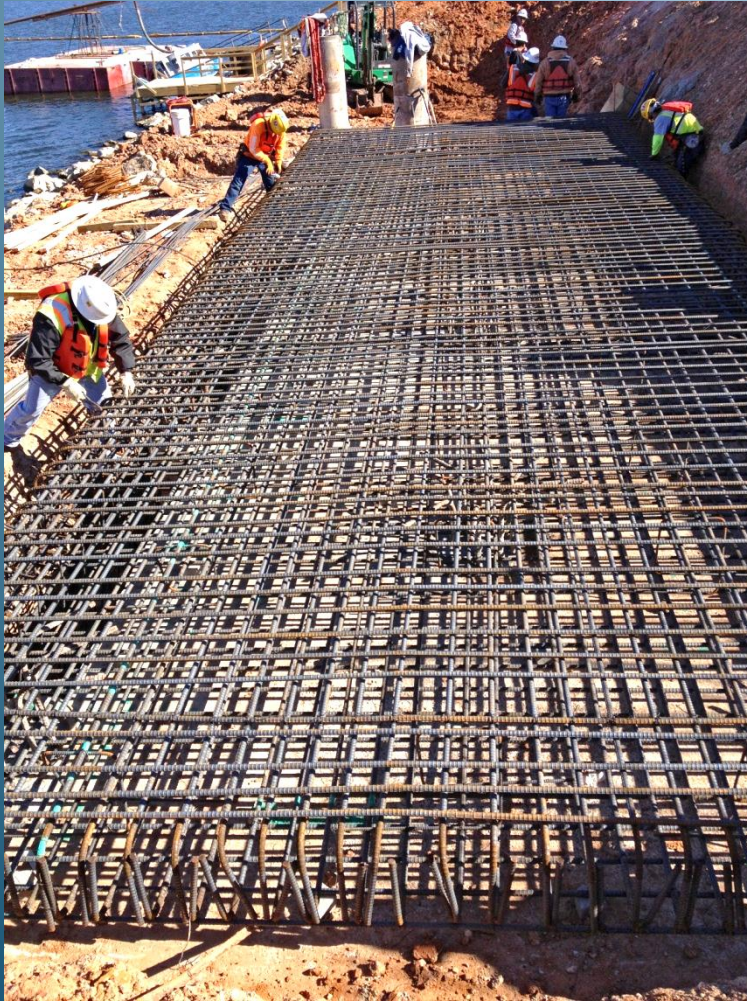
December 12, 2012 – Raw Water Pump Station Abutment