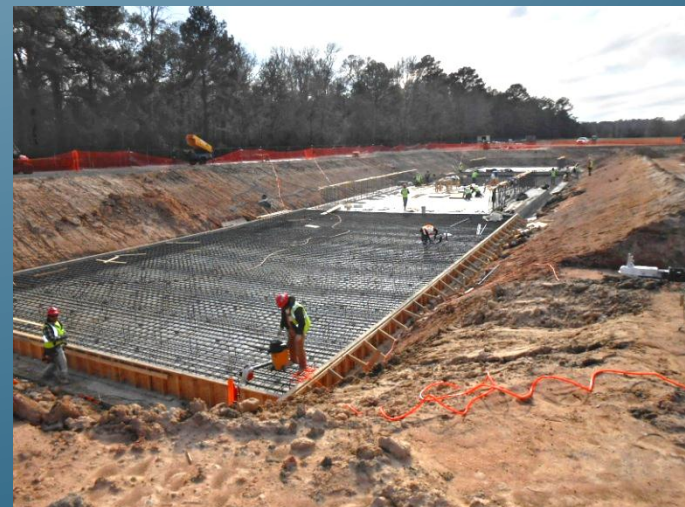
December 11, 2012 – High Service Discharge Pump Station