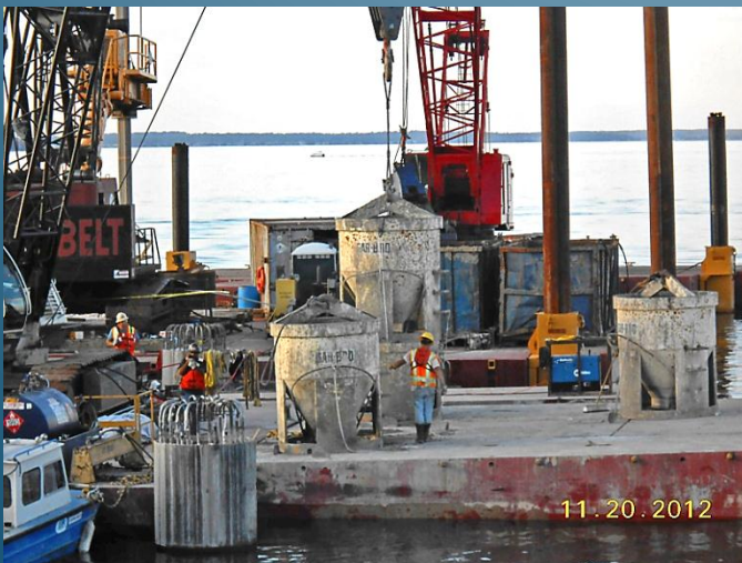
November 20, 2012 – Bent No. 2 at Raw Water Pump Station