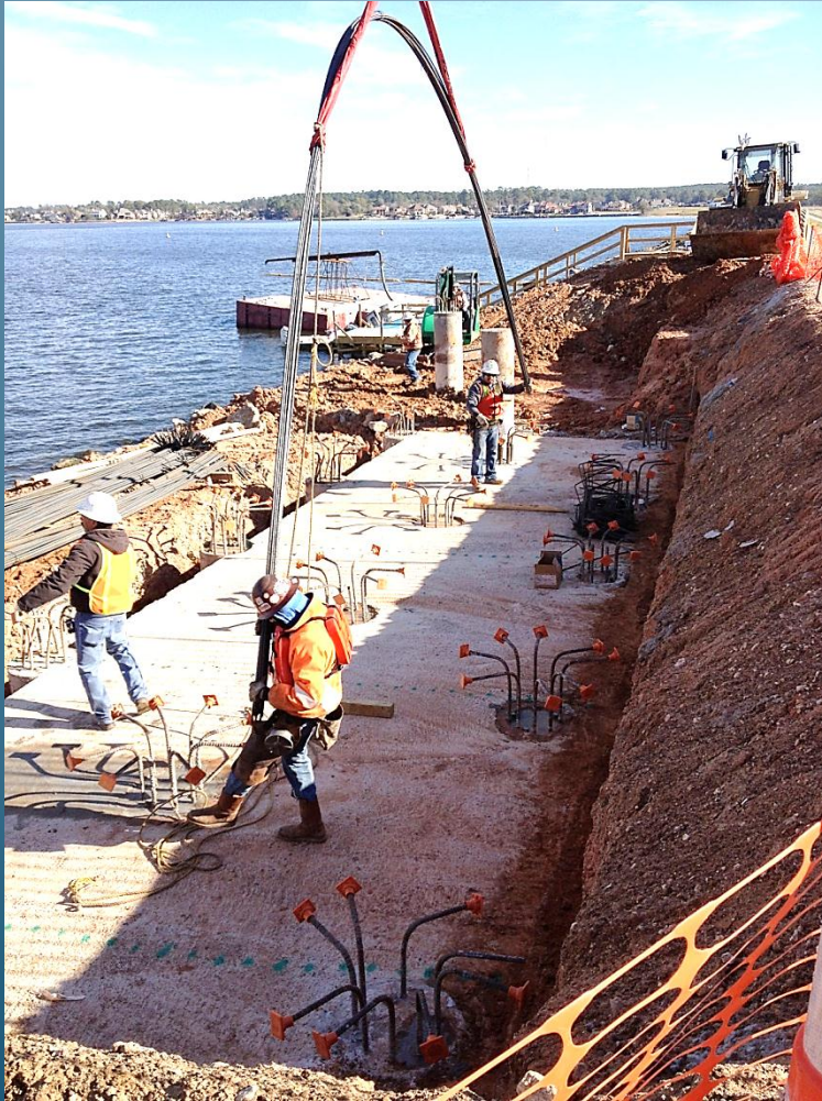
December 14, 2012 – Raw Water Pump Station Abutment