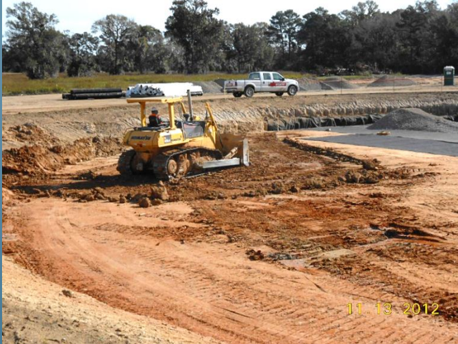
November 13, 2012 – Ground Storage Tank No. 2